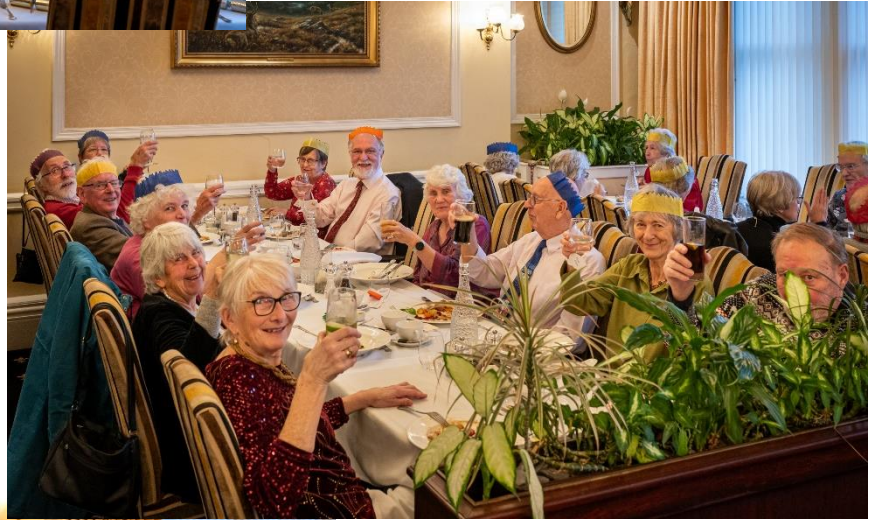
A Merry Old Time had by All