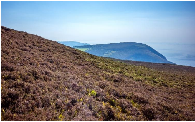
High on Holdstone Down