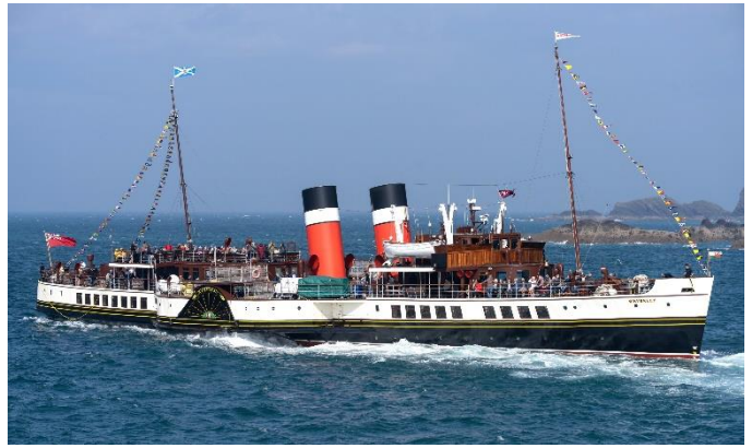
Waverley leaving Ilfracombe