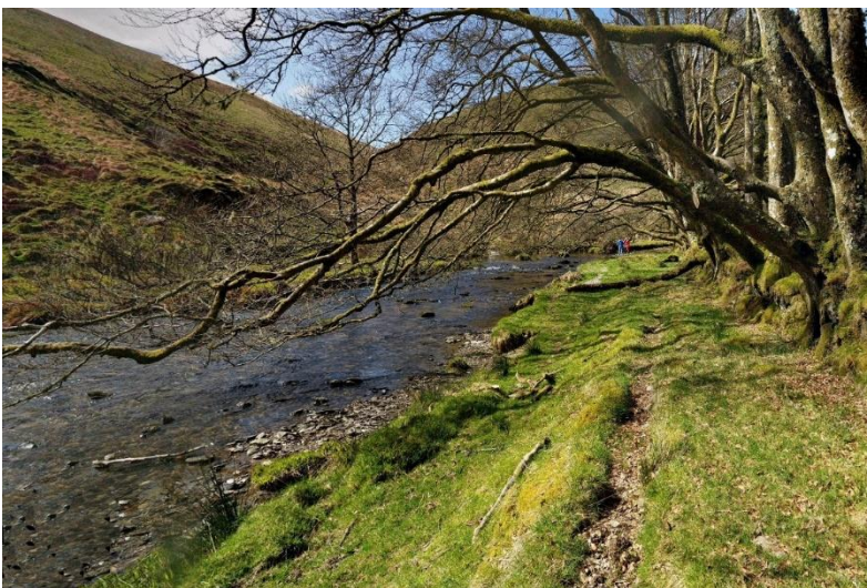
Path by the River Barle

Simonsbath — Picked Stones (or just Cow Castle and back)