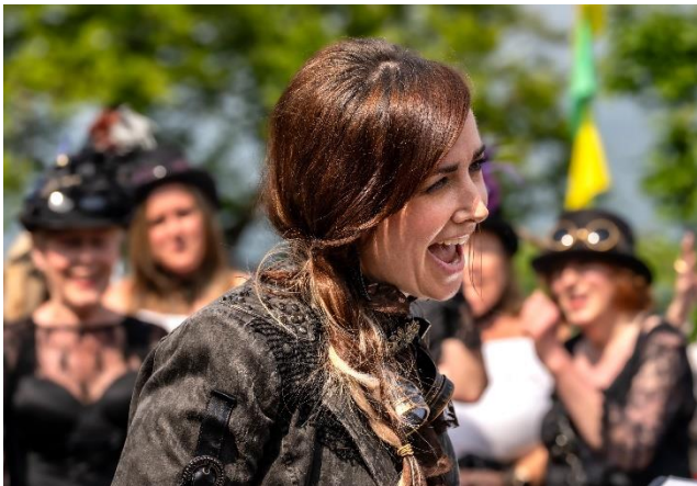
Dynamo Choir - Lynton's Steam Punk Saturday